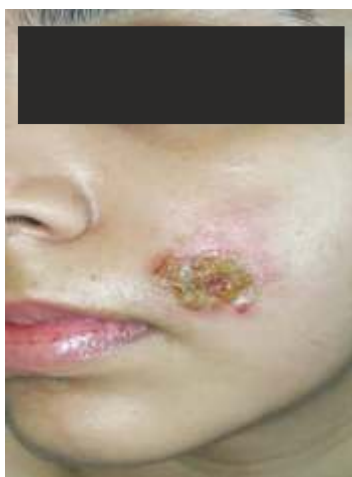
Figure 1. Before treatment