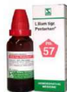
Lilium tigr. Pentarkan™ Liquid