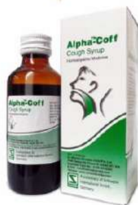
Alpha-Coff™ Cough Syrup