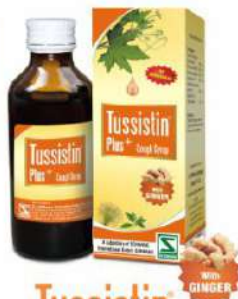
Tussistin® Plus+ Cough Syrup with Ginger