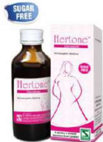
Hertone™ Uterotonic Safe for long term use Free from side effects