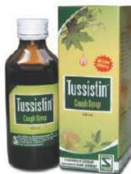
Tussistin® Cough Syrup for children