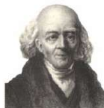
Hahnemann (1755-1843) Founder of Homoeopathy

The principle that "like can cure like" dates back to Vedas and Hippocrates. Hippocrates is known as father of medicines.