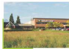
Nature's Way, USA