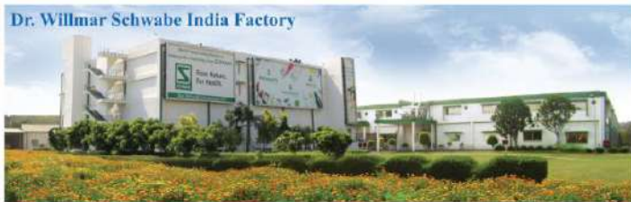
Dr. Willmar Schwabe India Factory

In July 1969, WHO (World Health Organization) at its 22nd Health Assembly laid the importance of G.M.P. (Good Manufacturing Practices) which has been well accepted worldwide and became a common practice in the pharmaceutical industry.